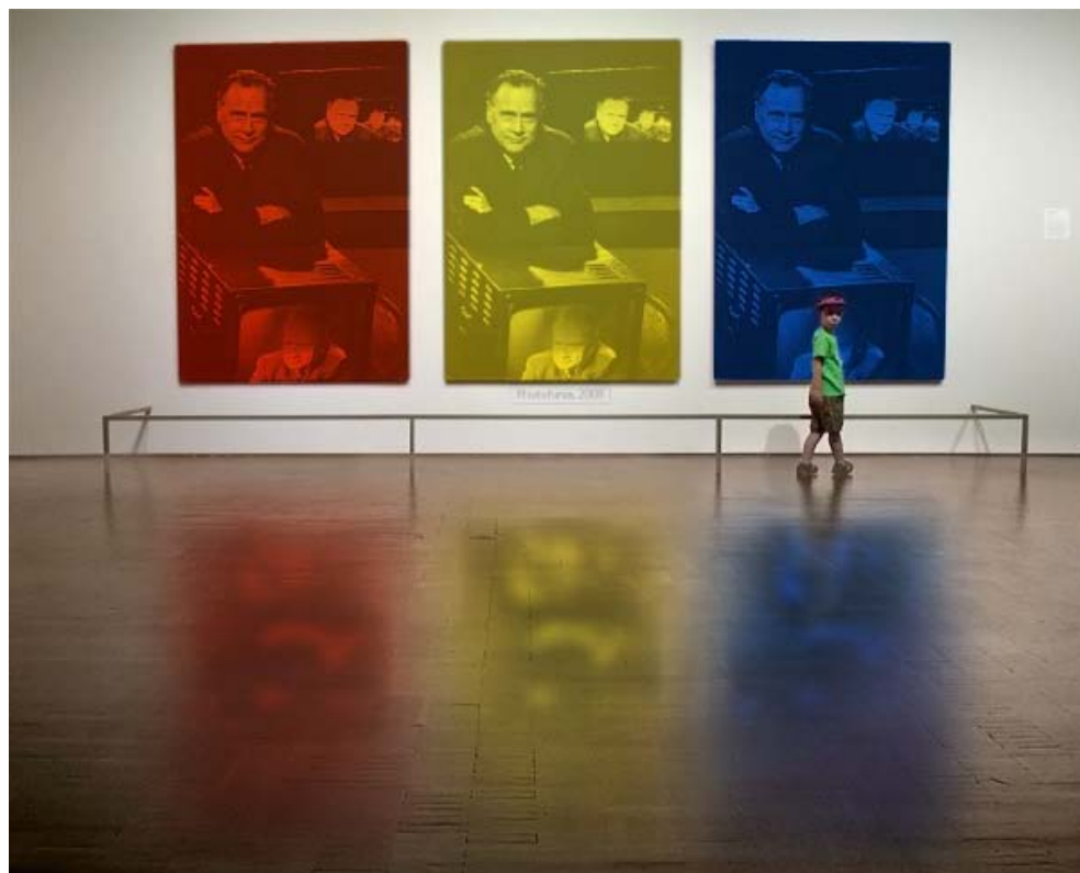
Marshall McLuhan

Insight? Understanding? Those are essential qualities for a portrait painter, and perhaps McLuhan would have made a fine one. He and Andy Warhol should have switched jobs.