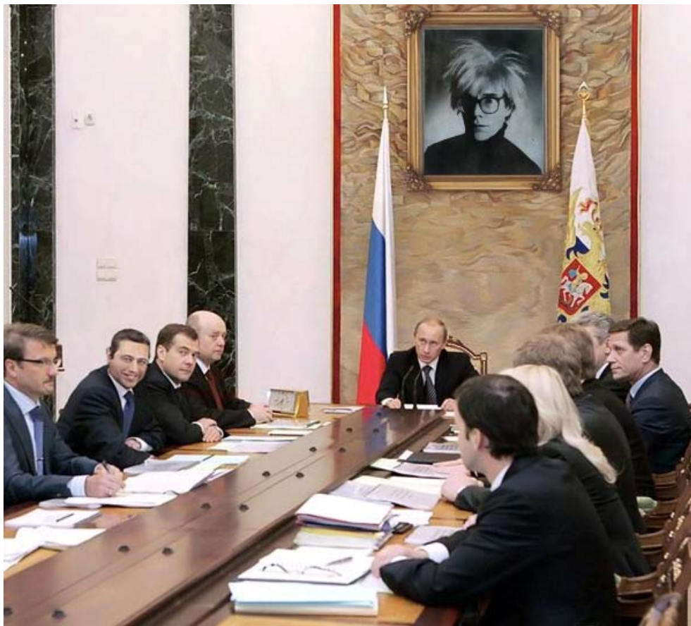
Andy Warhol and Vladimir Putin

Marshall McLuhan says that "One of the effects of living with electric information is that we live habitually in a state of information overload." What Warhol, in turn, understood about fame is that it cuts down the number of people we have to be interested in to a manageable number. Celebrities are the town characters in our "Global Village" — to use McLuhan's phrase — and they replace the saints of earlier centuries.