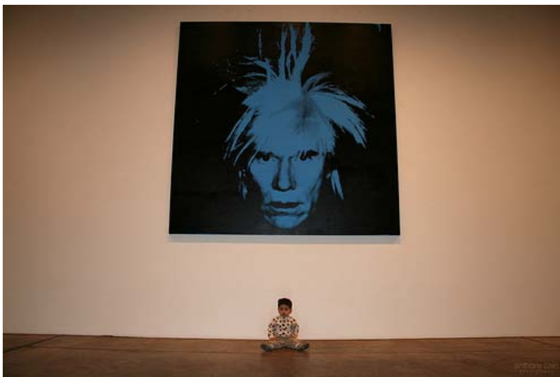
Andy Warhol "Self-Portrait," at the Warhol Museum